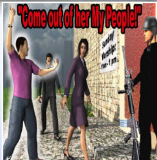
The Loud Cry call's God's sheep in other folds to join His Remnant people.

*Note: The Loud Cry of the Fourth Angel is the final urgent call to the sincere followers of Christ in spiritual Babylon to come out of her fellowship to join God's faithful people. Mystery Babylon represents fallen churches that teach the traditions of men above the commandments of God and is explained in greater detail in Lesson 25. Before Jesus comes the second time, every person must have an opportunity to hear and understand the Truth for this time. This will be accomplished through the outpouring of the Latter Rain and the giving of the Loud Cry. God's people will be given "great power" to proclaim the message, which will result in the earth will be "lightened with His glory."