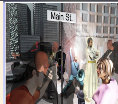
The Latter Rain will give power and boldness to God's people!

*Note: When Jesus said "this gospel", He was referring to the "everlasting gospel" and the present truth of the Three Angel's Messages of Revelation 14:6-12. Jesus equipped the early church with the Early Rain to begin the proclamation of the gospel and He will equip the end time church with the Latter Rain to finish the work of the gospel. The Latter Rain will give power and boldness to God's people to proclaim the warning message in the Three Angel's Messages and to give the Loud Cry of the Fourth Angel's Message. (See lesson 14 for more info on the 3 Angel's Messages.)