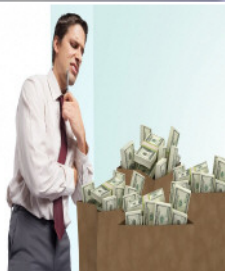
The rich will oppress the poor and will persecute the righteous in the last days!

2 - The Latter Rain will fall in a time when the rich are fraudulent to their "laborers" and living in sinful "pleasure." They also have "killed and condemned the just."